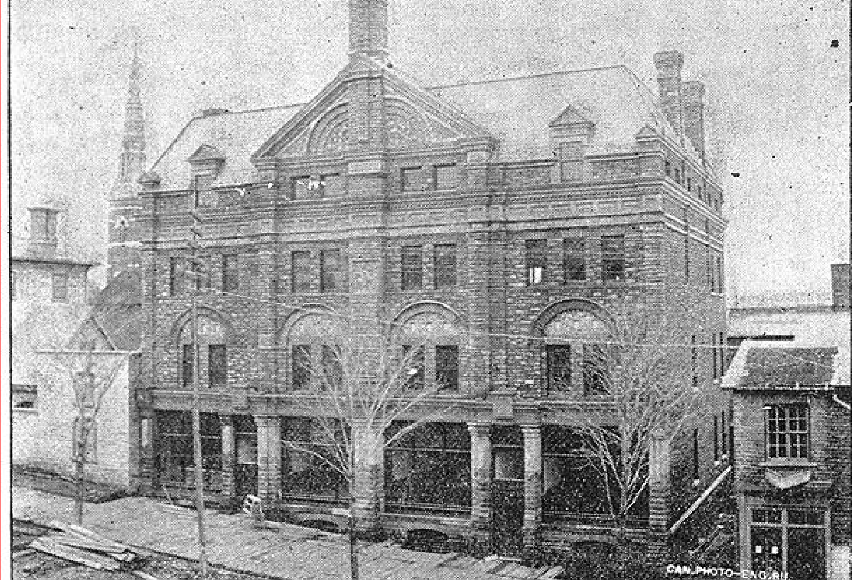
THE W. H. COMSTOCK CO., LTD.