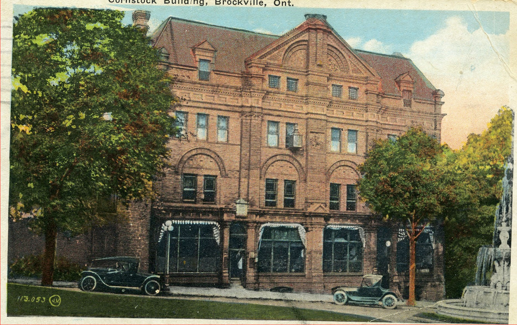
Cornstock Building, Brockville, Ont.