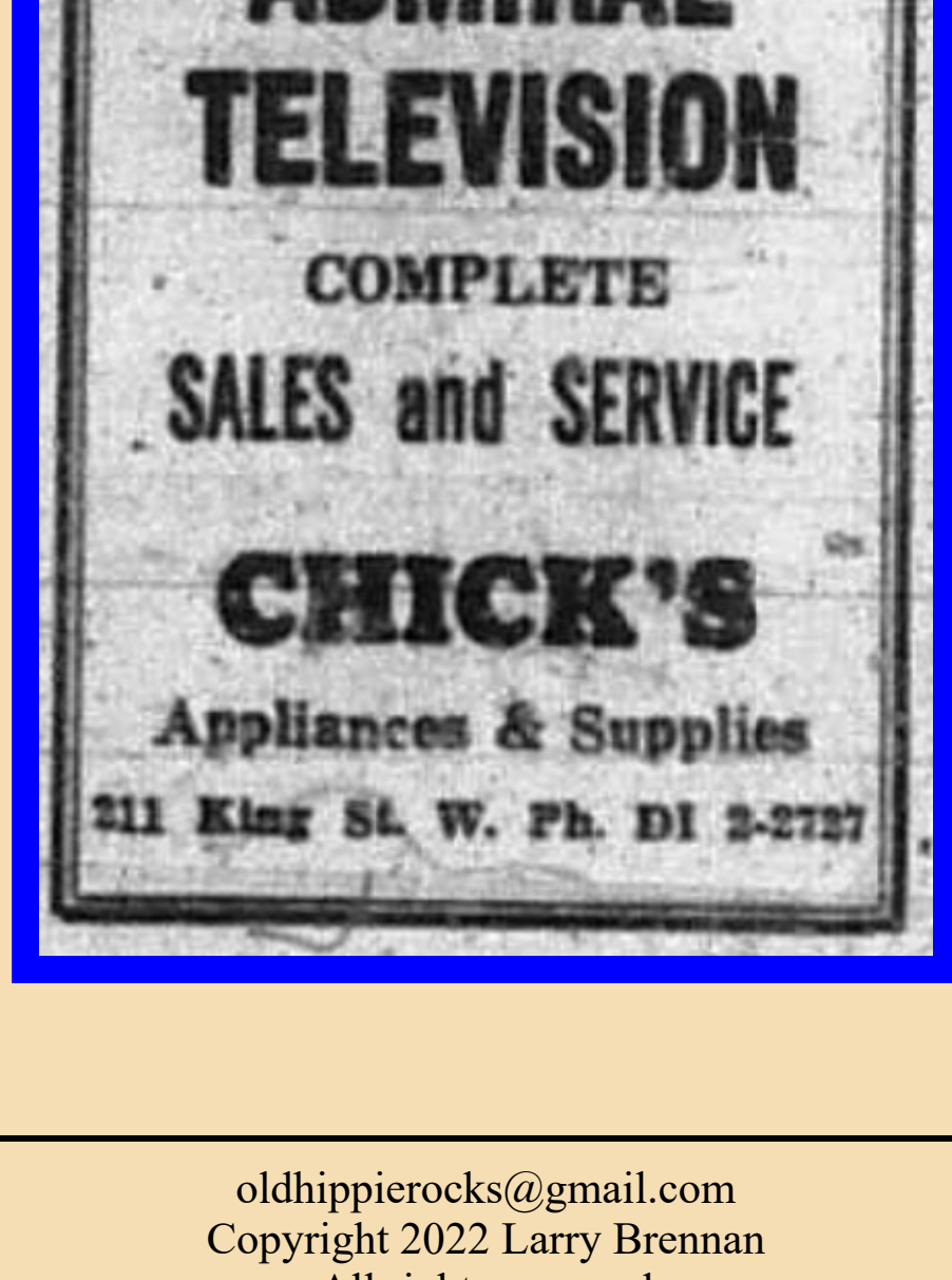
Chick Brother's Appliances, 1958;