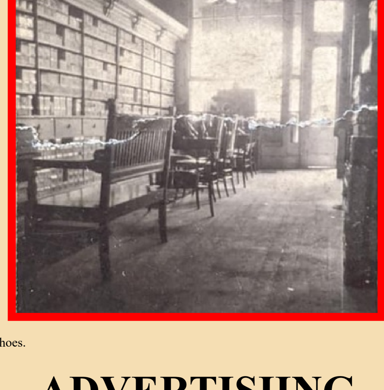
The interior of Gilhooly Shoes.