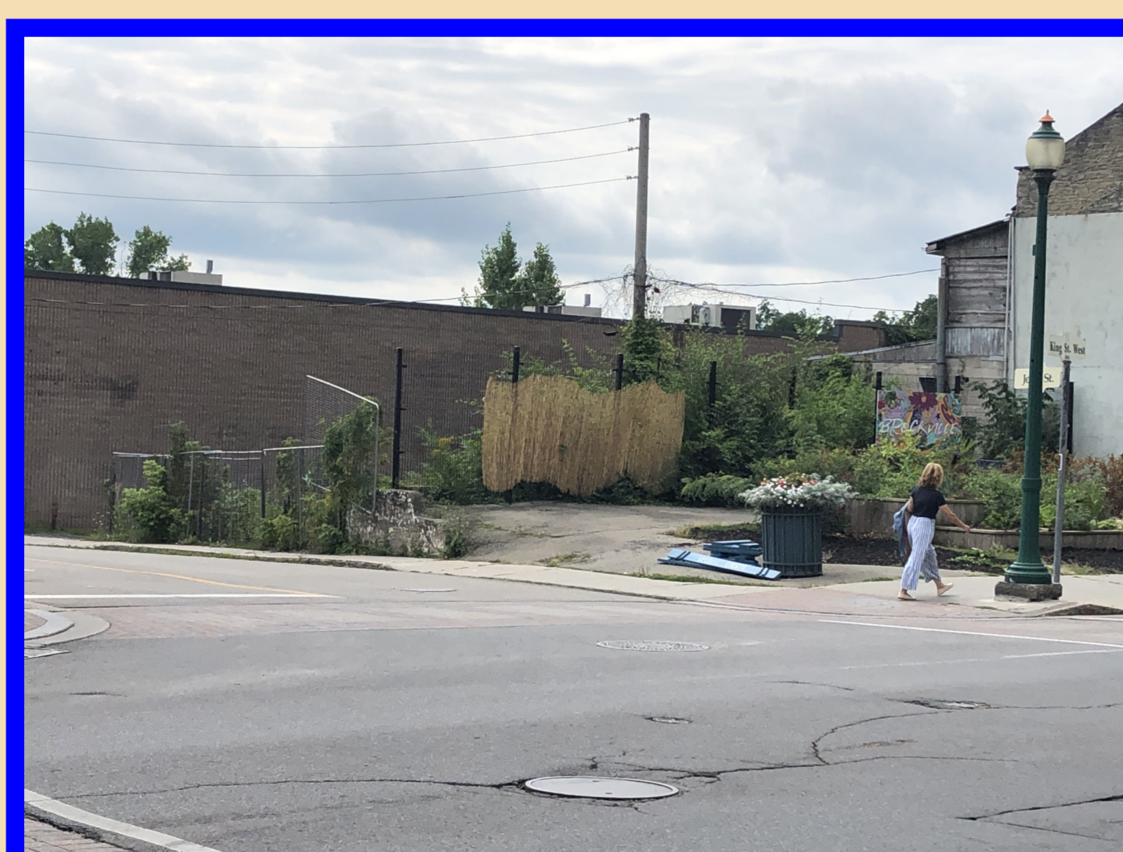
After the gas station / Brockville Cable TV building was demolished, the lot has stayed empty for many years.