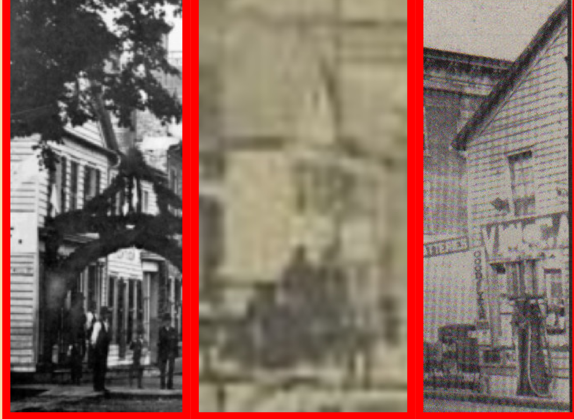
1874 Brosius's drawing from the back, three photos: 1860, c1915, c1920.