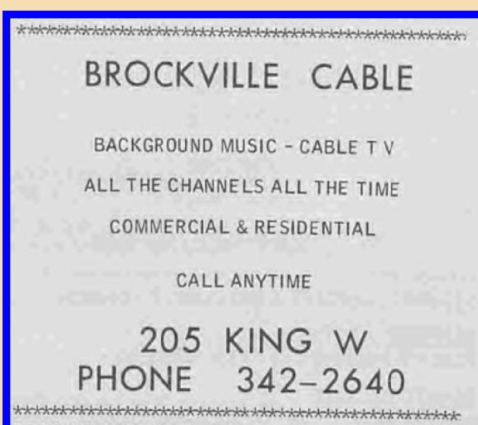
Brockville Cable AD, 1966