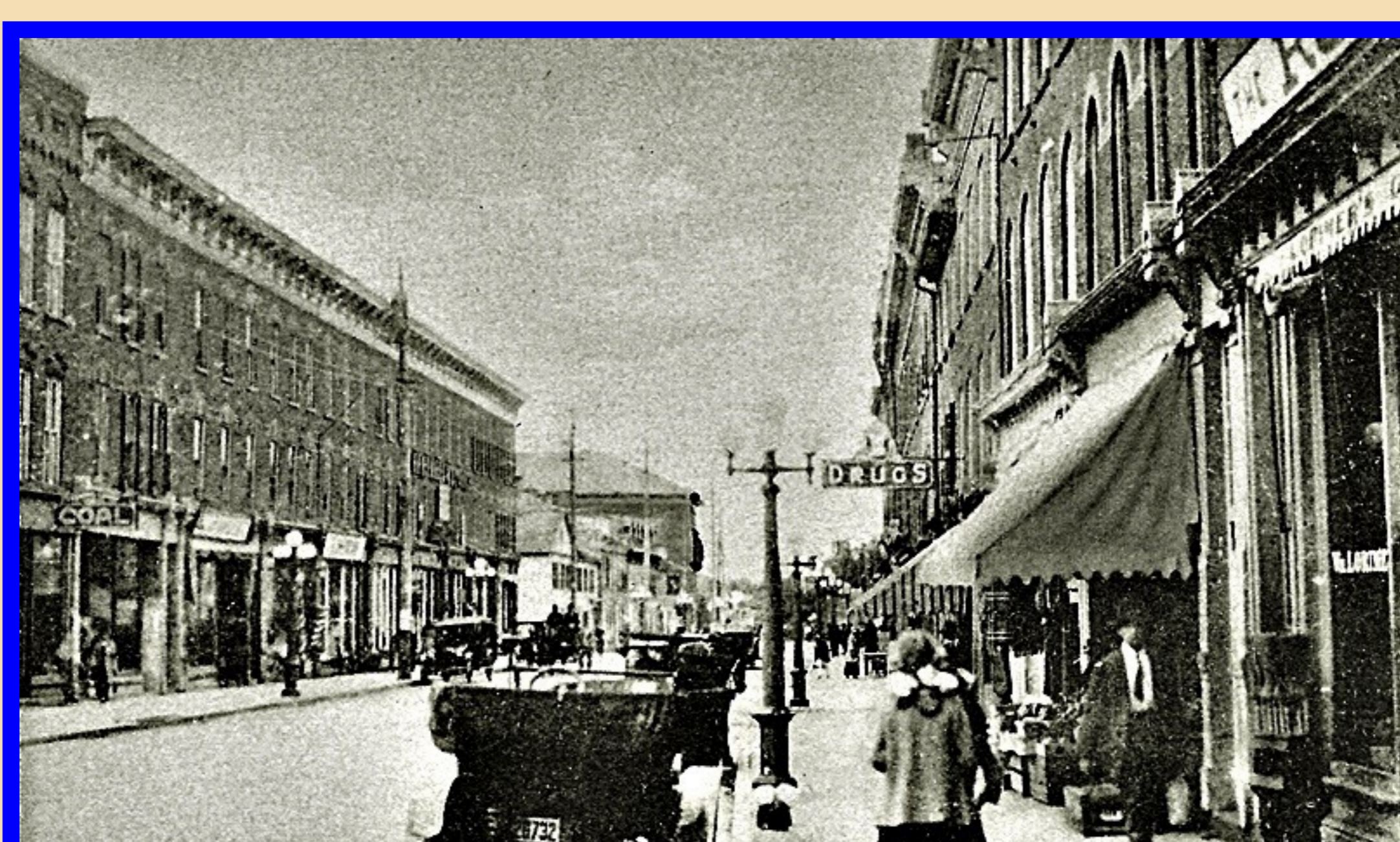
The Gilmour Building can be seen at the end of the large Halliday Block on the other side of John St. around 1915.