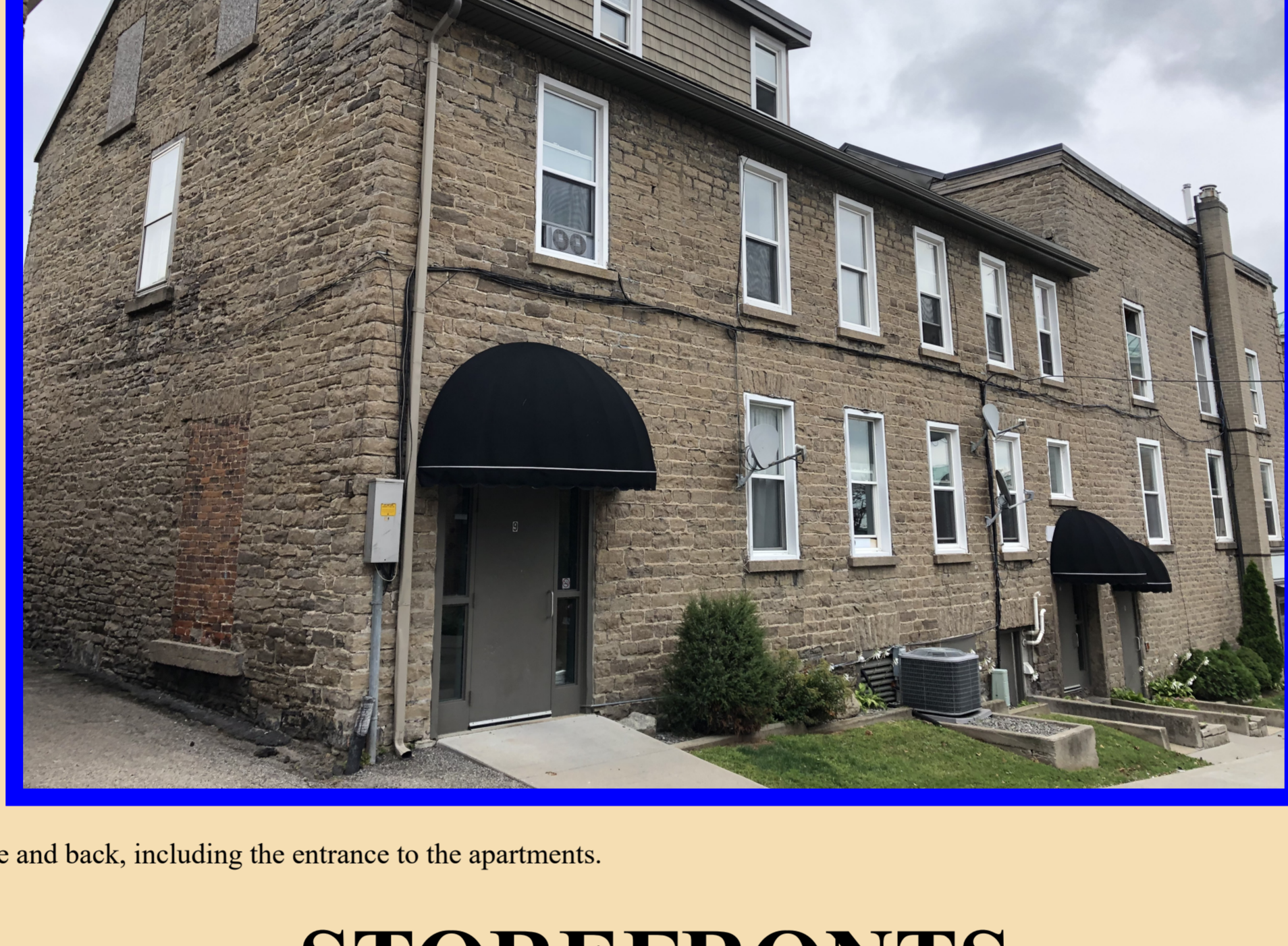
The side and back, including the entrance to the apartments.