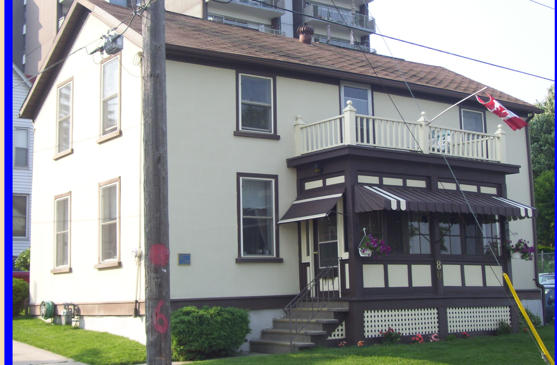
80 Water St. East (Former address: 18 Water St.)