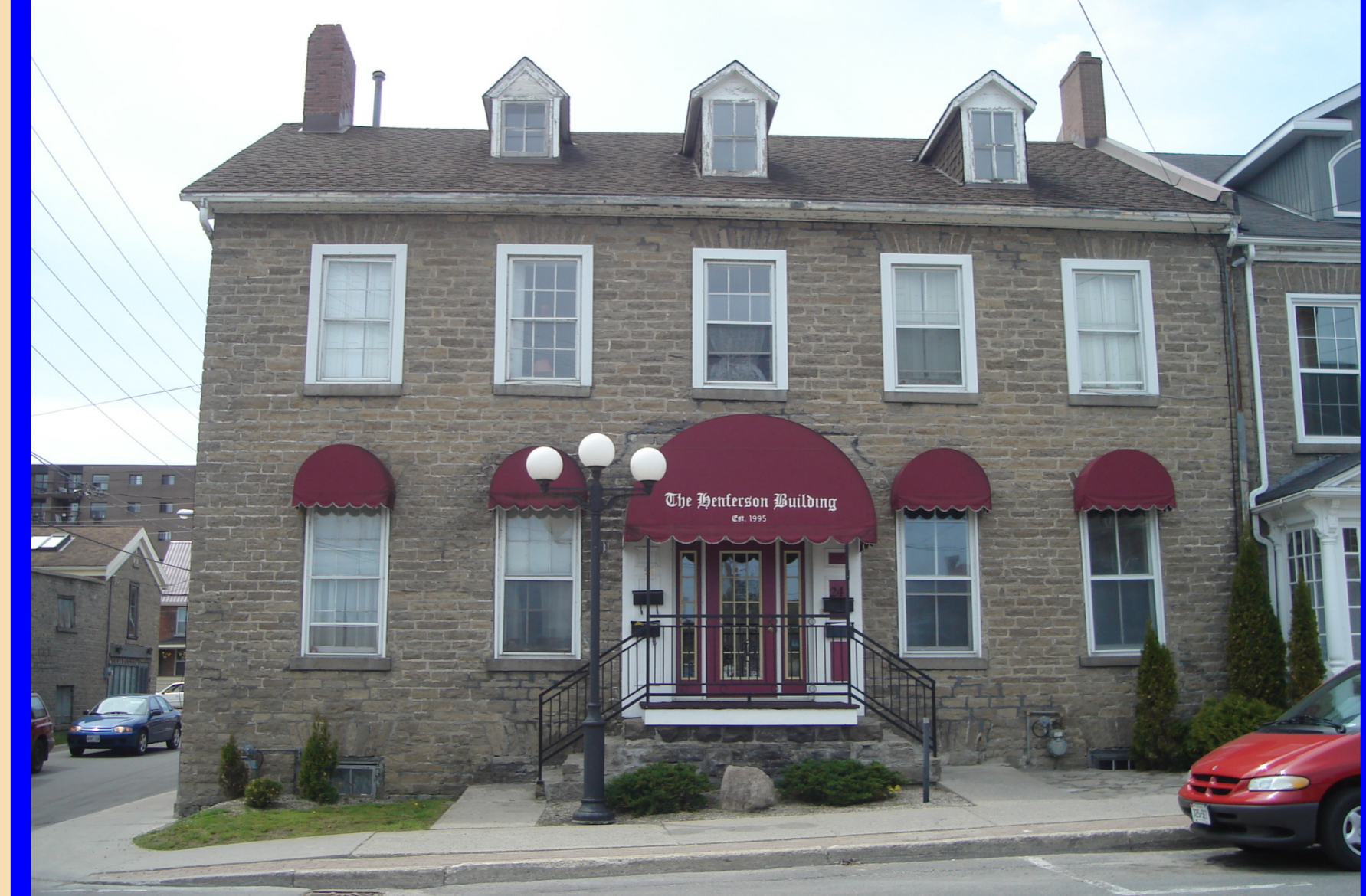
22, 24 Broad St. East (Former address: 30, 32 Broad St.)