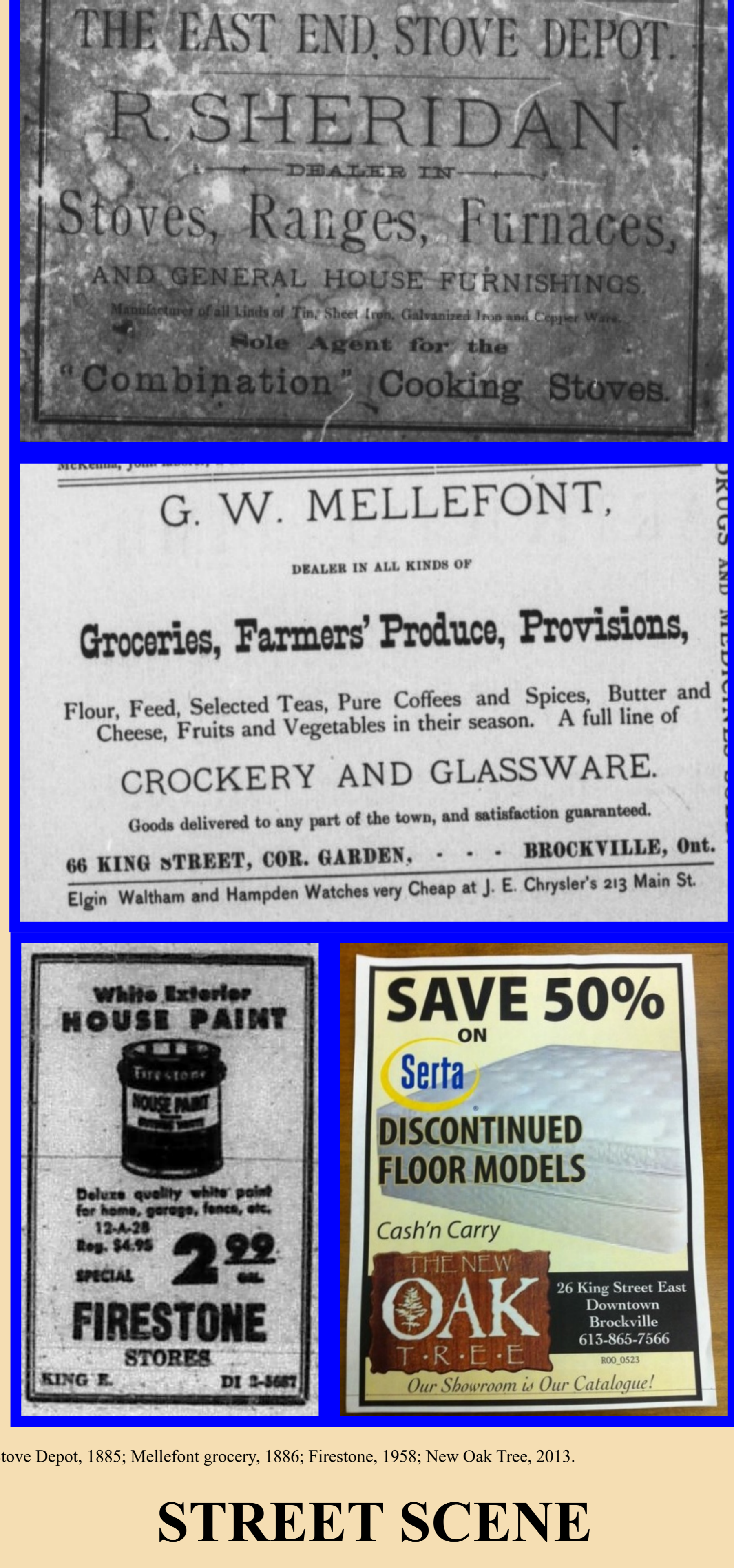
East End Stove Depot, 1885; Mellefont grocery, 1886; Firestone, 1958; New Oak Tree, 2013.