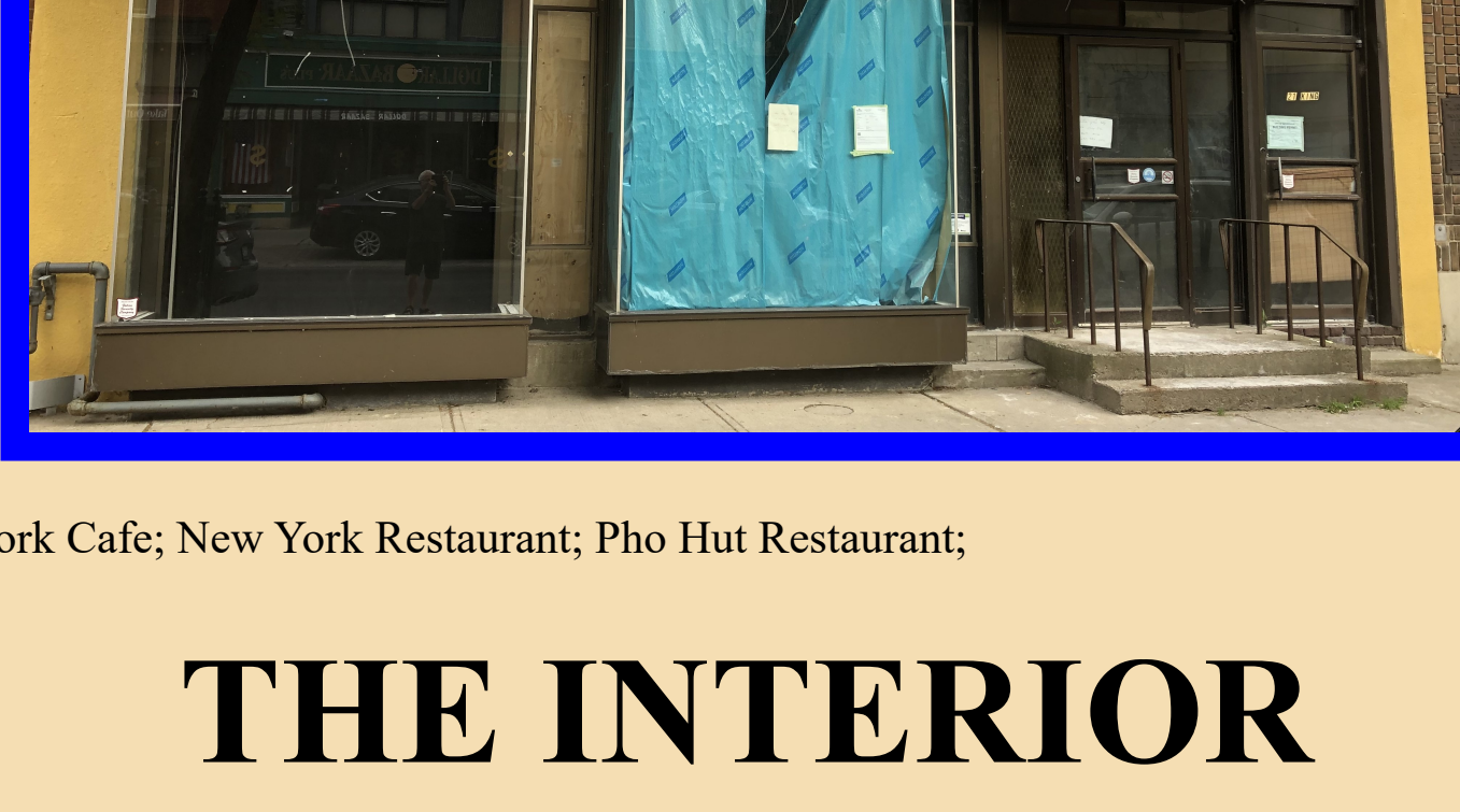
New York Cafe; New York Cafe; New York Restaurant; Pho Hut Restaurant;