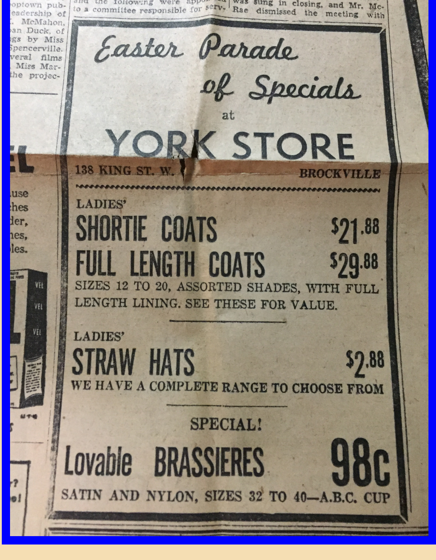
York Store, 1953;